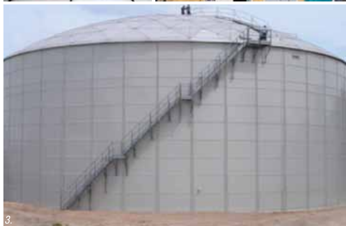
1. RTP Construction Potable Water 2. RTP Construction - Potable Water - 4 million gallons/ 15,000 m 3 3. Bolted Steel Floor